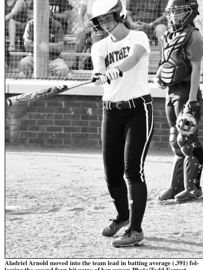
lowing the second four-hit game of her career.